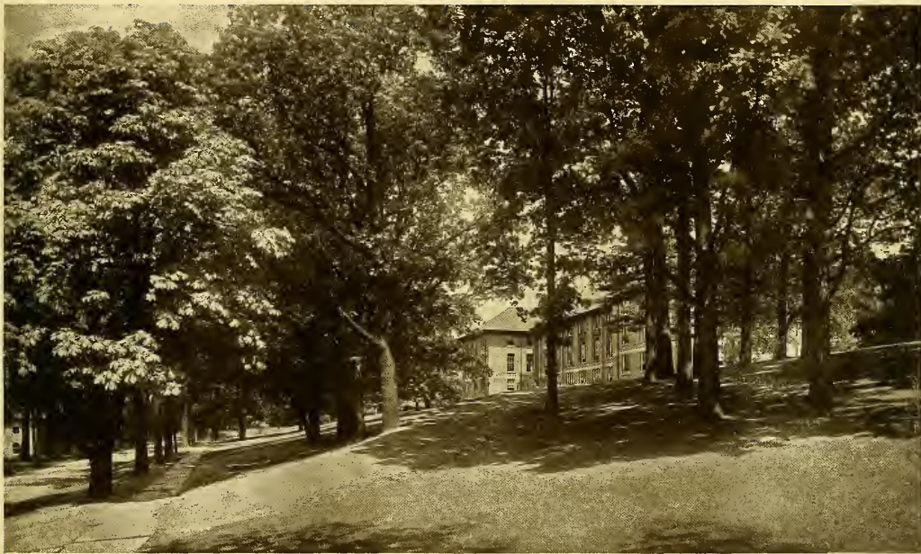
EAST AVENUE AND ROCKEFELLER HALL